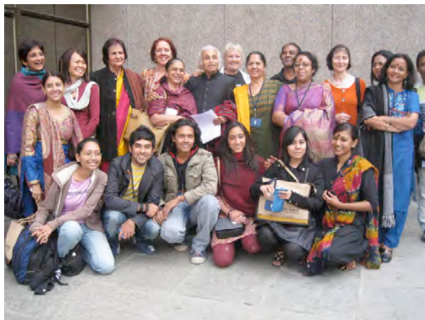
WDA-BD members in Delhi