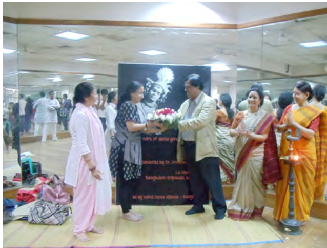
Workshop on Uday Shankar by Urmimala Sarkar