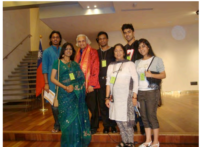
WDA-BD dancers in New York